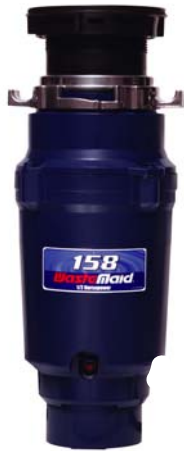
1/2 HP STANDARD